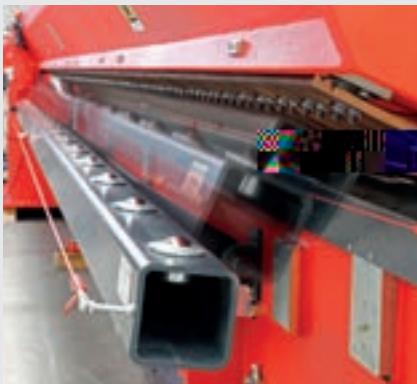
/ Supporting bar with rollers